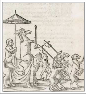
Illustration from La nobiltà dell' asino (The Nobility of the Ass), by Banchieri, 1599